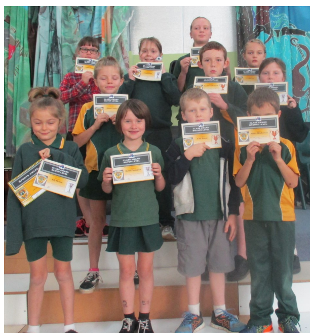
Class Level Awards

Entries at www.trialbaytri.com.au and www.coastline.com.au